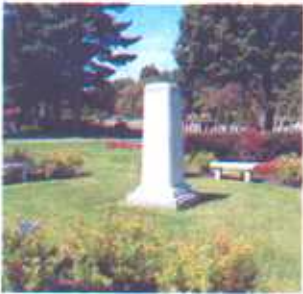
Example of Shared Memorialization - Central Obelisk Marker - Image and Sketch Plan, Woodlawn Cemetery, Everett, MA.