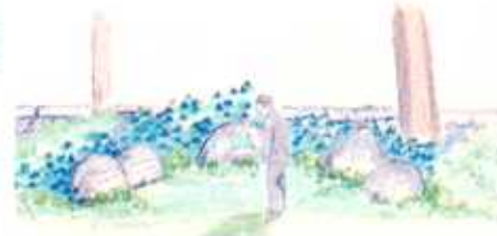
Use of Natural Materials to Create Intimate Settings