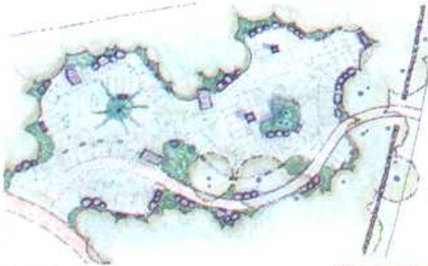
Sketch Plan of Proposed 'Green Cemetery' Development at Ridgewood Cemetery, North Andover, MA incorporates a variety of memorialization options: shared obelisk, boulder memorials, upright markers, and stone slabs for both full-body and cremation graves.