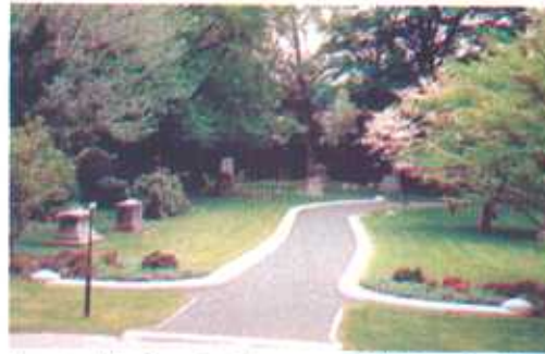
Innovative Use of granite edging as memorials - Vesper Path, Mt. Auburn Cemetery, Cambridge, MA.