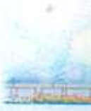
Sketch and As-Built of Above-Ground Memorial of Almy Memorialization burial and memorial at Mt. Auburn Cemetery, Cambridge, MA.