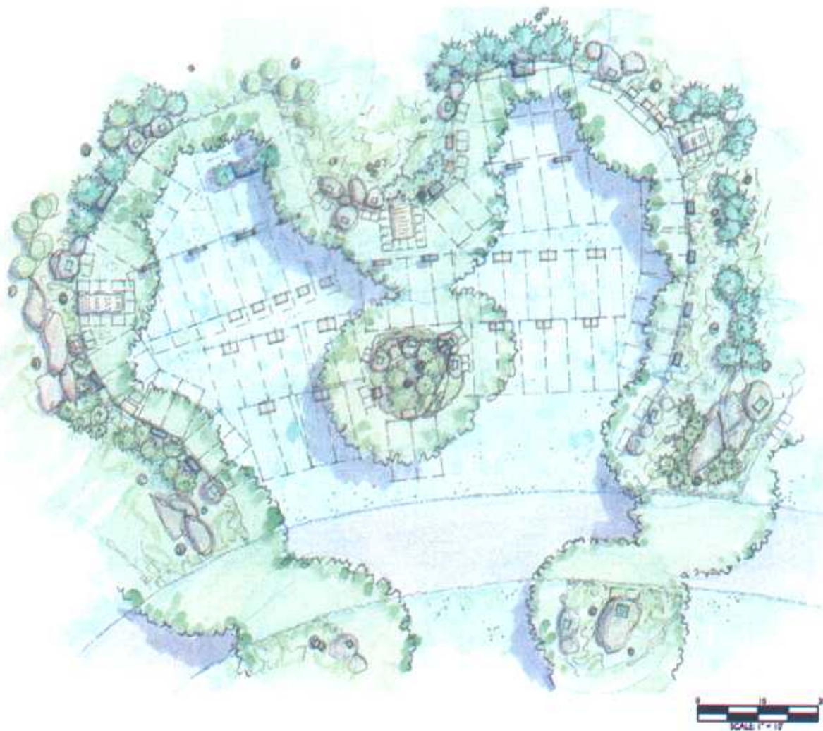
WESTON CEMETERY - Prototype Grave Layout Illustrative Blow-Up Plan Showing Typical Grave Layout - February 28, 2011