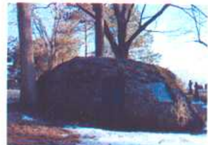
Existing Boulders Used for Shared Memorialization - Walnut Hills Cemetery, Brookline, MA.