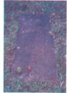
Stone Slab Shared Memorial, Burnett Burial Ground, Southborough, MA.